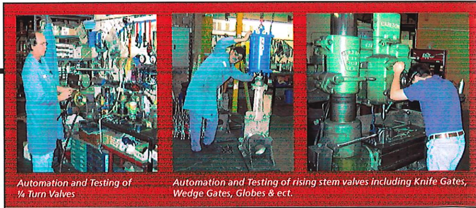
Automation and Testing of 1/4 Turn Valves

Wolseley Industrial Group Valve Automation Shops have the necessary conventional machine tools needed for your valve modifications, bracket & coupling manufacturing and all other fabrication that you may require. These tools provide the capability for: Turning, Milling, Drilling, Boring and much more.